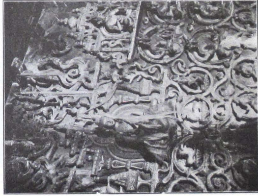
(d) EAST WALL, CENTRE, OF GSER-KHAN.