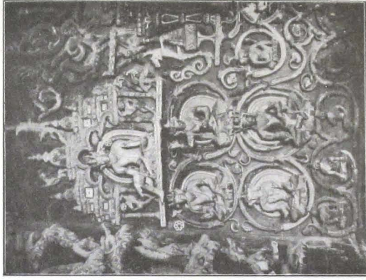
(c) EAST WALL WITH A SMALL PART OF NORTH WALL OF GSER-KHAN.