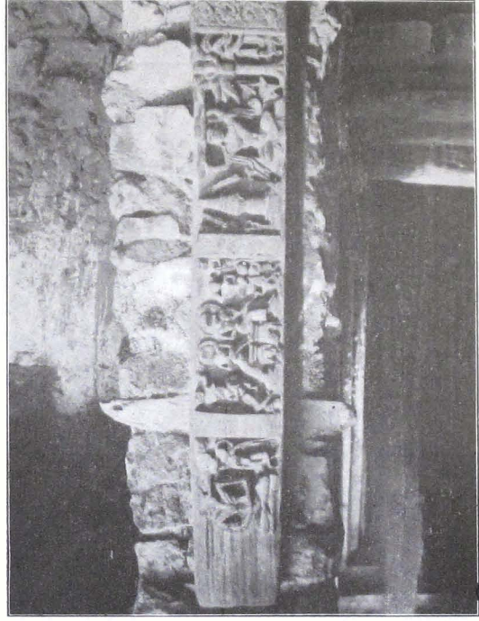
(a) CARVED LINTEL BEAM.