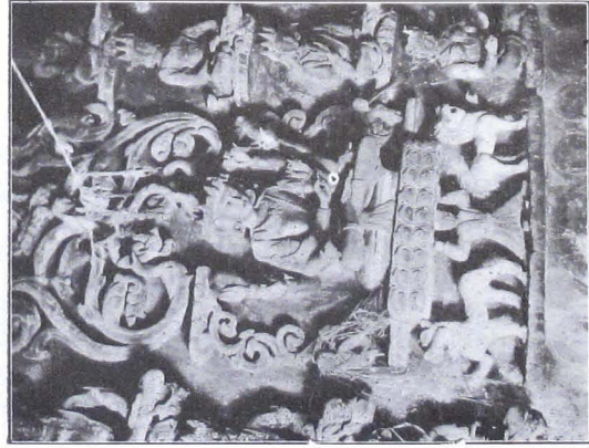
(b) NORTH WALL OF GSER-KHAN.