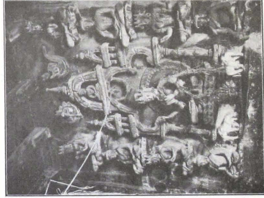
(e) SOUTH WALL OF GSER-KHAN.